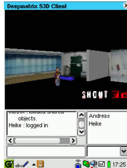
Figure 1: PDA client of a collaborative virtual environment, Sharp Zaurus

About 80% of our students are already professionals which study mainly in the evening and on weekends. Therefore, there is a need for mobile solutions of learning environments for synchronous events at a fixed timeslot. We developed a client/server based multiuser virtual reality environment (collaborative virtual environment, CVE, based on Java and VRML) to offer our students a 'virtual campus'. We modified a Java applet based DeepMatrix[1] client of the 'virtual campus' in a way that it can be used by mobile users (equipped with PDAs or smartphones). The modified client is now based on a Java application which runs on a Personaljava virtual machine. Personaljava [2] is a Java runtime environment for mobile devices with limited resources (e.g. graphic resolution of 240x320 pixel, no hardware 3D acceleration). Implementations of Personaljava are available for Windows CE, Linux, Palm and Symbian OS based PDA and mobile phone platforms. To provide location based services for local (campus) mobile PDA users, a GPS based localization is used together with the collaborative virtual environment.